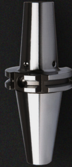
SHRINK FIT HOLDER