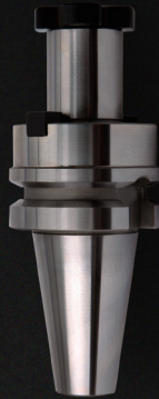
SHELL MILL ARBOR