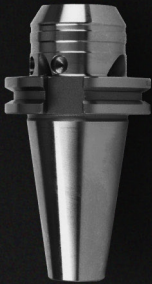
HYDRAULIC CHUCK (Power E)