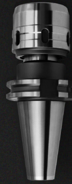
POWER MILLING CHUCK